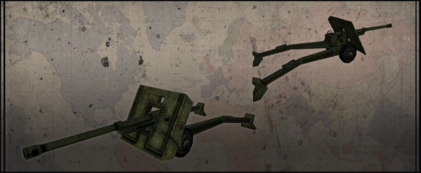
17 POUNDER AT GUN

The Ordnance Quick-Firing 17 pounder was a 76.2 mm (3 inch) gun developed by the United Kingdom during World War II. It was used as an anti-tank gun on its own carriage, as well as equipping a number of British tanks. It was the most effective Allied anti-tank gun of the war. Used with the APDS shot it was capable of defeating all but the thickest armour on German tanks.